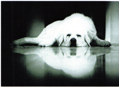
By Cheryl Decker