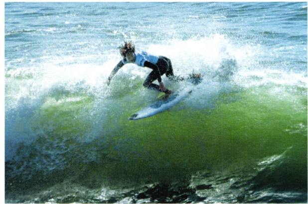
By Elaine Calvert