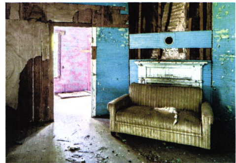
By Chuck Ubele