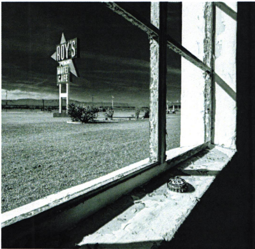
By Ed E Powell