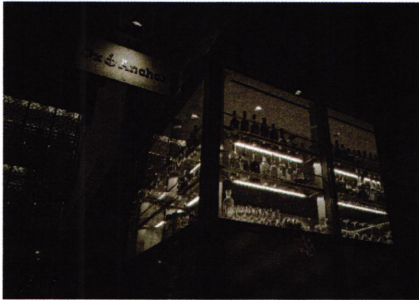
By Allan Upshaw