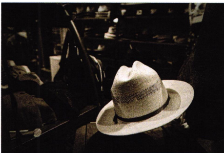
By Allan Upshaw