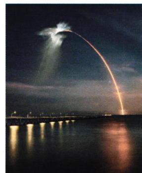
By Chuck Ubele