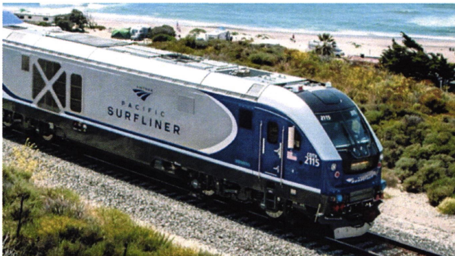
Photo Ops: The Train Ride Mission San Juan Capistrano St. Joseph's Day and Return of the Swallows Festival Los Rios Historic District