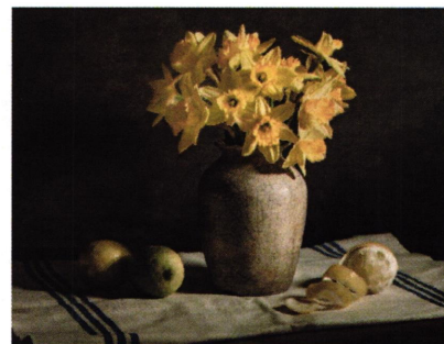
By Elaine Calvert