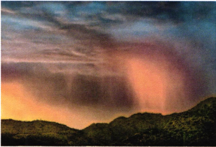
By Cheryl Decker