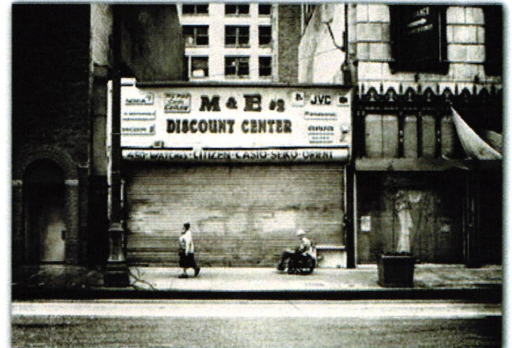
M&E Discount Center