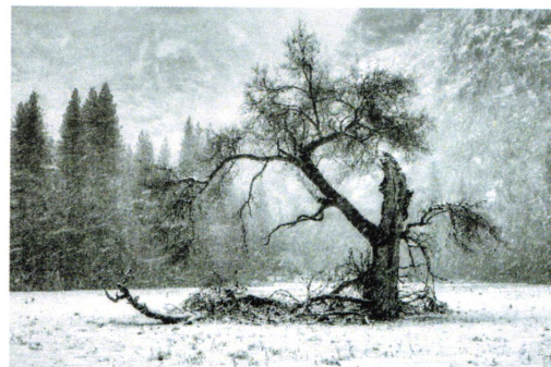
By Elaine Calvert