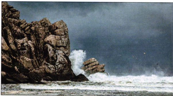
By Gregory Doudna