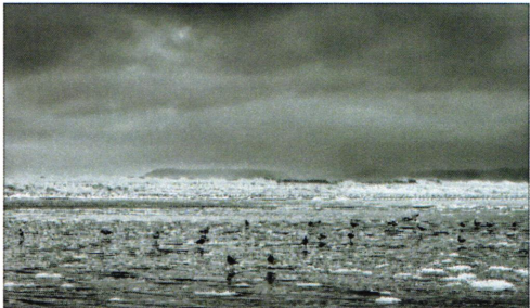
By Gregory Doudna