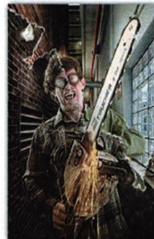
Cutting Through The Grunge by Chuck Uebele