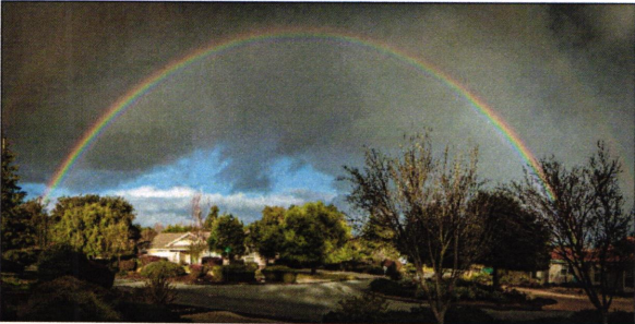
By Gregory Doudna