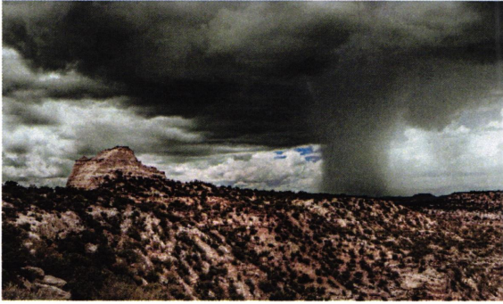
By Ed E Powell